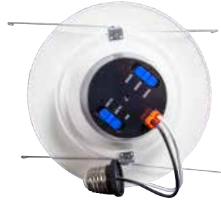
5 1/2" Selectable Recessed Downlight