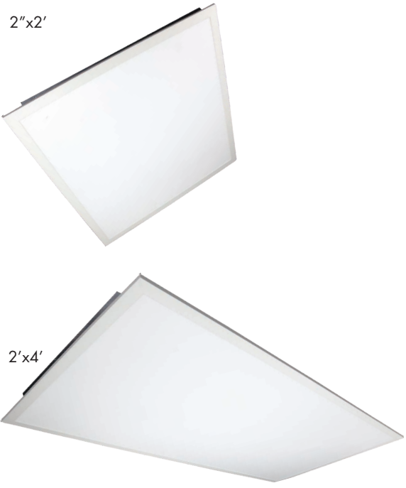
2' x 2' Pro Line Panel