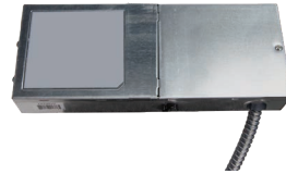
Wattage Selectable Driver